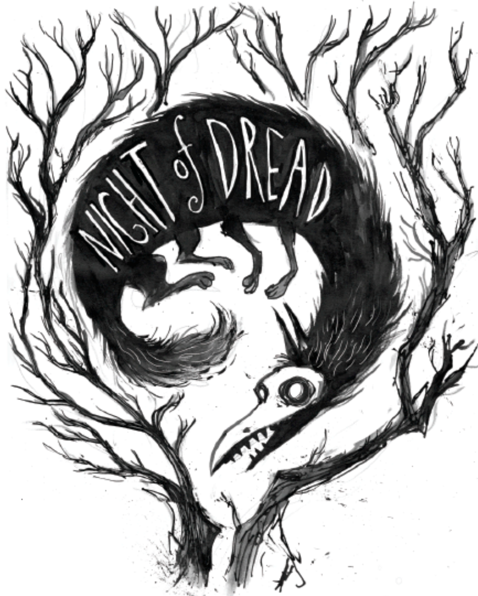
ILLUSTRATION - KATHRYN ALLISON THORNTON 2015

CLAY & PAPER THEATRE PRESENTS THE 17TH ANNUAL